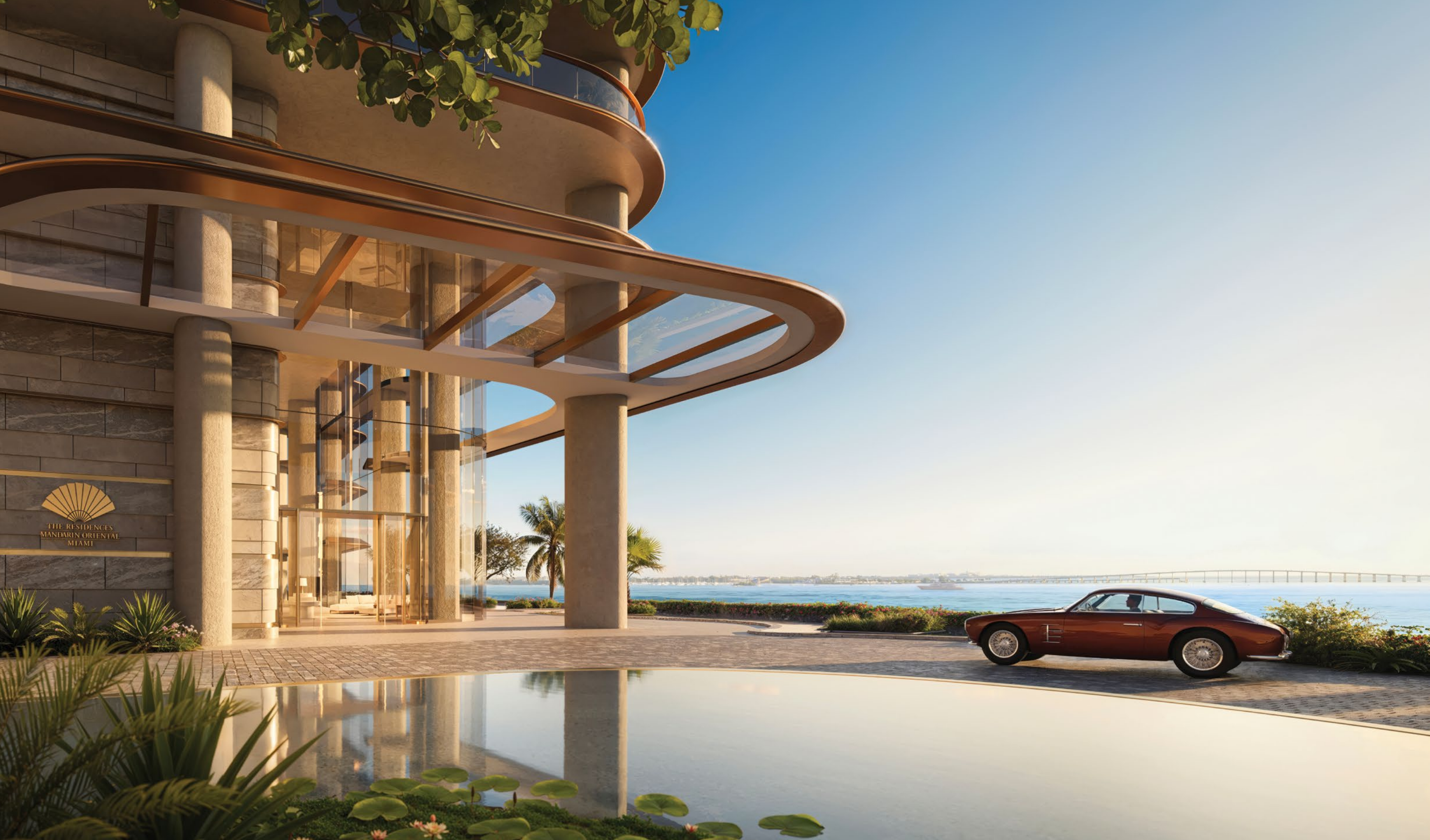
South Tower Porte Cochère