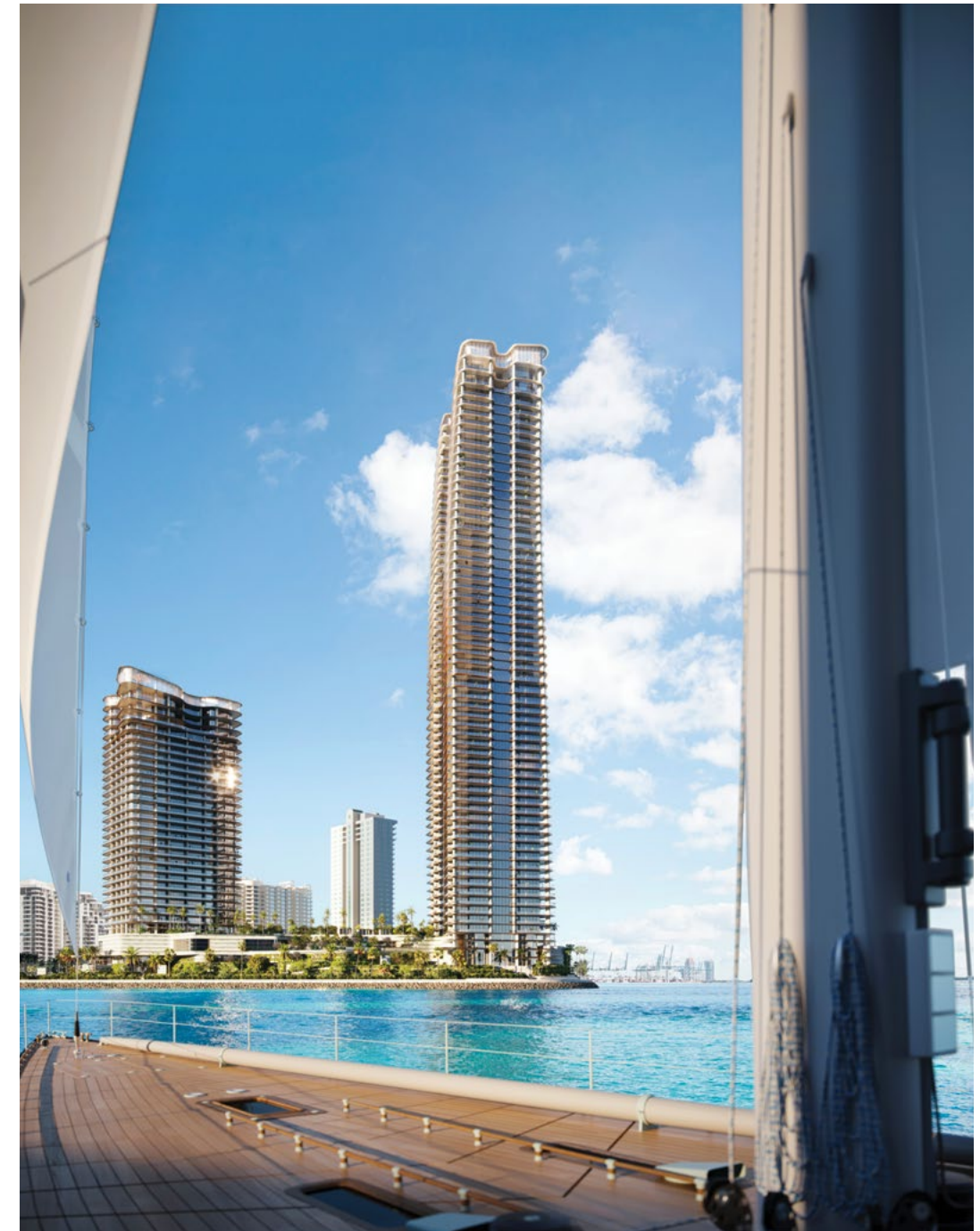
An exclusive oasis of calm, The Residences offers a refreshing retreat, while being only moments from the vibrant city center.