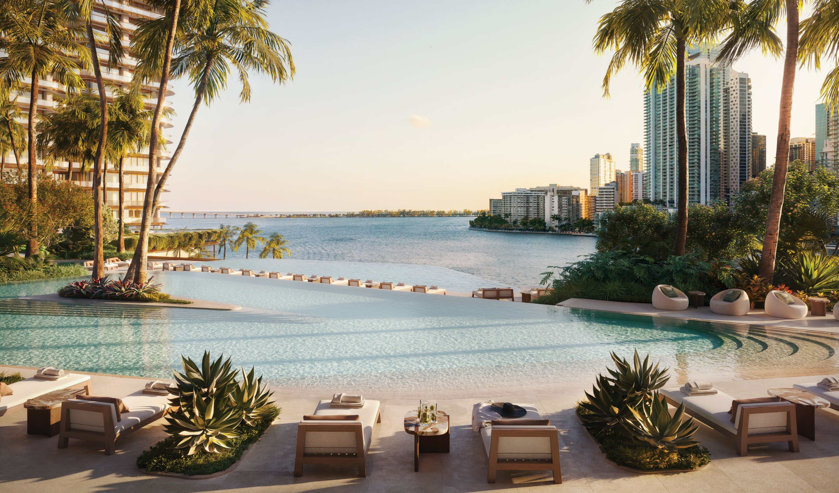
View of Biscayne Bay from the Resort Pool