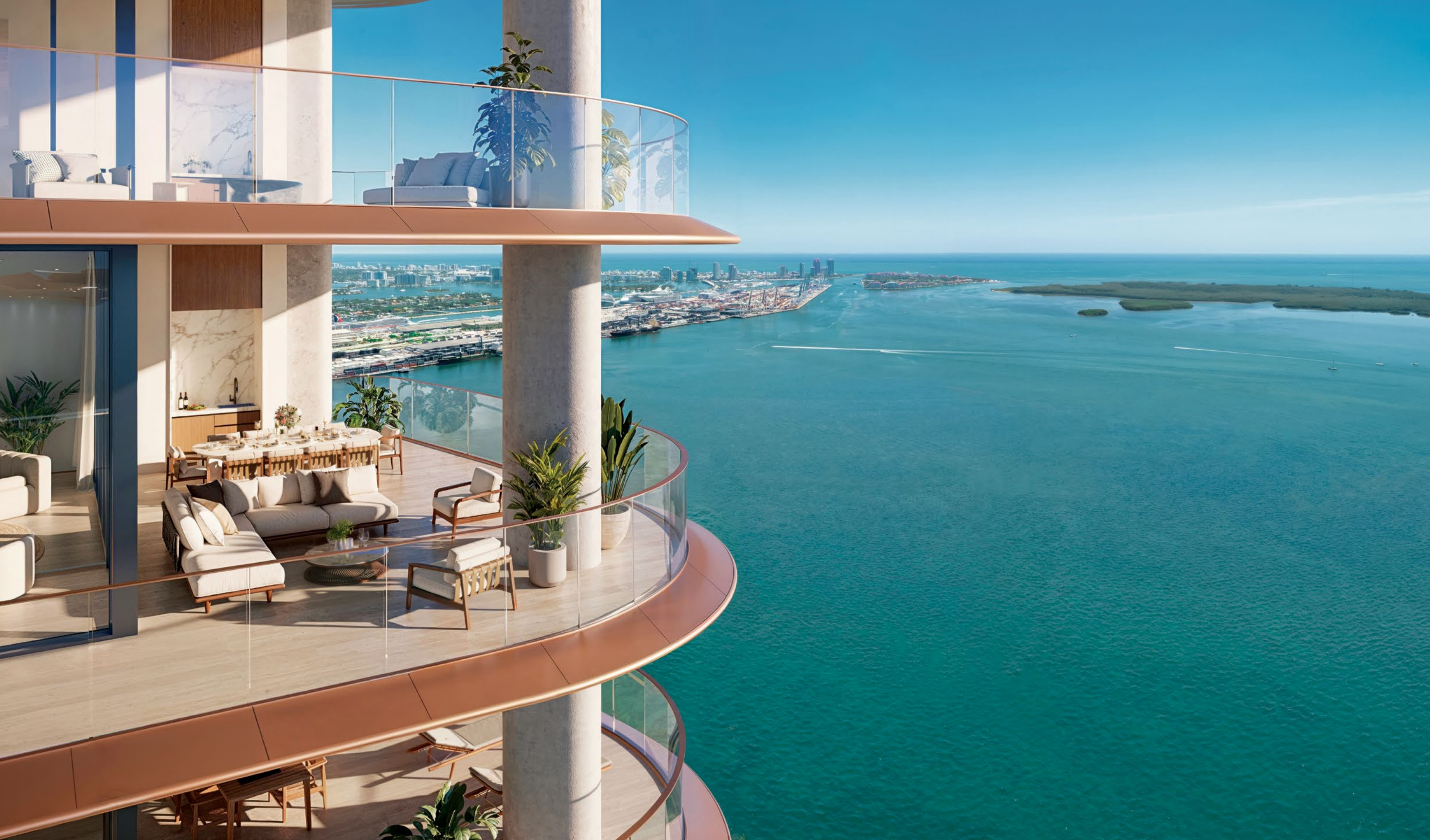
South Tower terraces overlooking Biscayne Bay