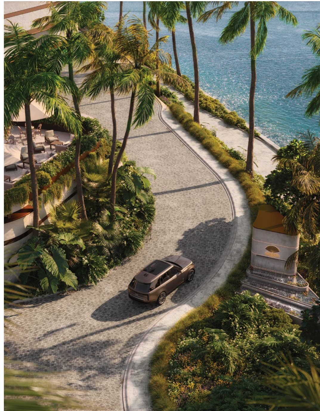
Secluded and sophisticated, The Residences is an island on an island.